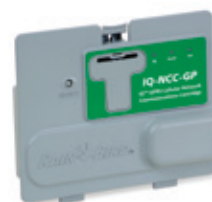
IQ NCC-GP Communication Cartridge