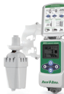
WR2-RFC Wireless Rain/ Freeze Sensor

The ESP-LXD supports up to 4 weather sensors, one local and up to three additional on the two-wire path interfaced with SD-210 sensor decoders. Supported Rain Bird sensors include the RSD wired rain sensor, the WR2-RC wireless rain sensor, the WR2-RFC wireless rain/freeze sensor and the ANEMOMETER wind sensor (the Rain Bird 3002 Pulse Transmitter is required for use of the ANEMOMETER). Soil moisture sensors that provide a normally closed switch interface are also supported.