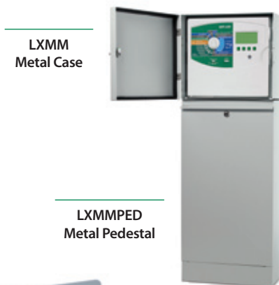
LXMM Metal Case

The ESP-LXD Controller has an optional LXMM Metal Wall-Mount Case and LXMM-PED Metal Pedestal. The ESP-LXD standard plastic case field installs into the LXMM and can be wall-mounted or attached to the LXMMPED for free-standing controller applications. The LXMM and LXMM-PED use powder-coated steel for years of rust-free operation.